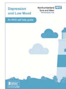
Depression and Low Mood